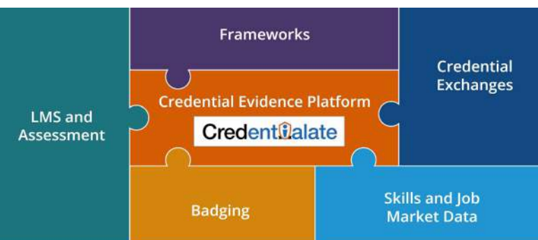
Figure 3. Credentialate in the Evolving Skills Ecosystem

This is important to both learners and the employment marketplace as it gives them a place to "meet" and exchange information.